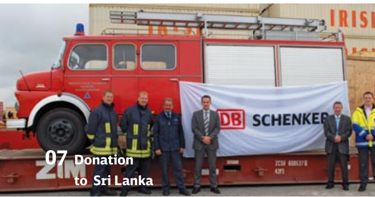
07 Donation to Sri Lanka