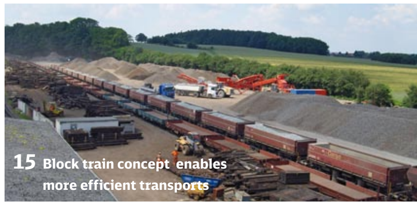
15 Block train concept enables more efficient transports