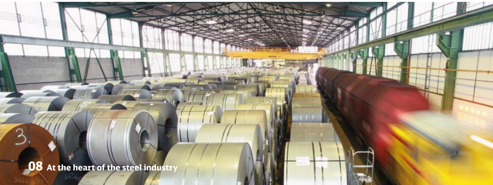
08 At the heart of the steel industry