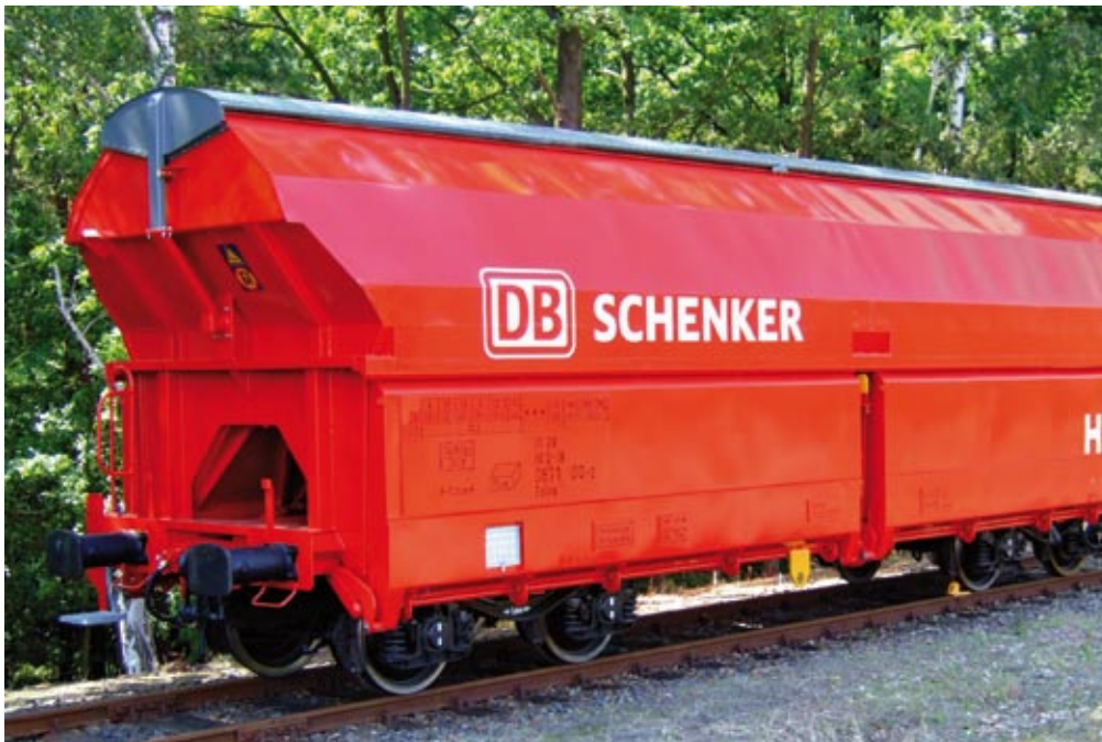
The new Talns series 971 bulk freight wagons feature hydraulically operated side flaps for even faster unloading

full 105.5 tons. That means that for Benteler alone, it will be possible to cut the wagon resources used by 20 percent.