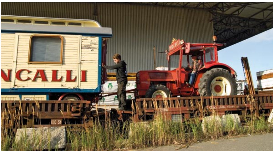
A pro at work: Loadmaster Robert-Peter Hiebner uses a tractor to carefully push a circus trailer on to a flat wagon

This is why the sequence used to load the circus trailers played a decisive role. “We used the ‘First in, Last out’ principle here,” notes Hiebner. “This means that the first circus trailers we need to assemble the circus tents are the last ones to be loaded on to the block trains.” During the unloading process the first vehicles to come down the ramp are the mast wagon with the tent poles, then the dome, circus tent and electrics wagon, and finally the electrical and hose wagon. After Hamburg the circus will move on to Bremen and then to its winter quarters. The sequence does not, however, have to be observed for the return to Cologne-Mühlheim in mid-December because that’s when the circus takes a well-deserved break. ■